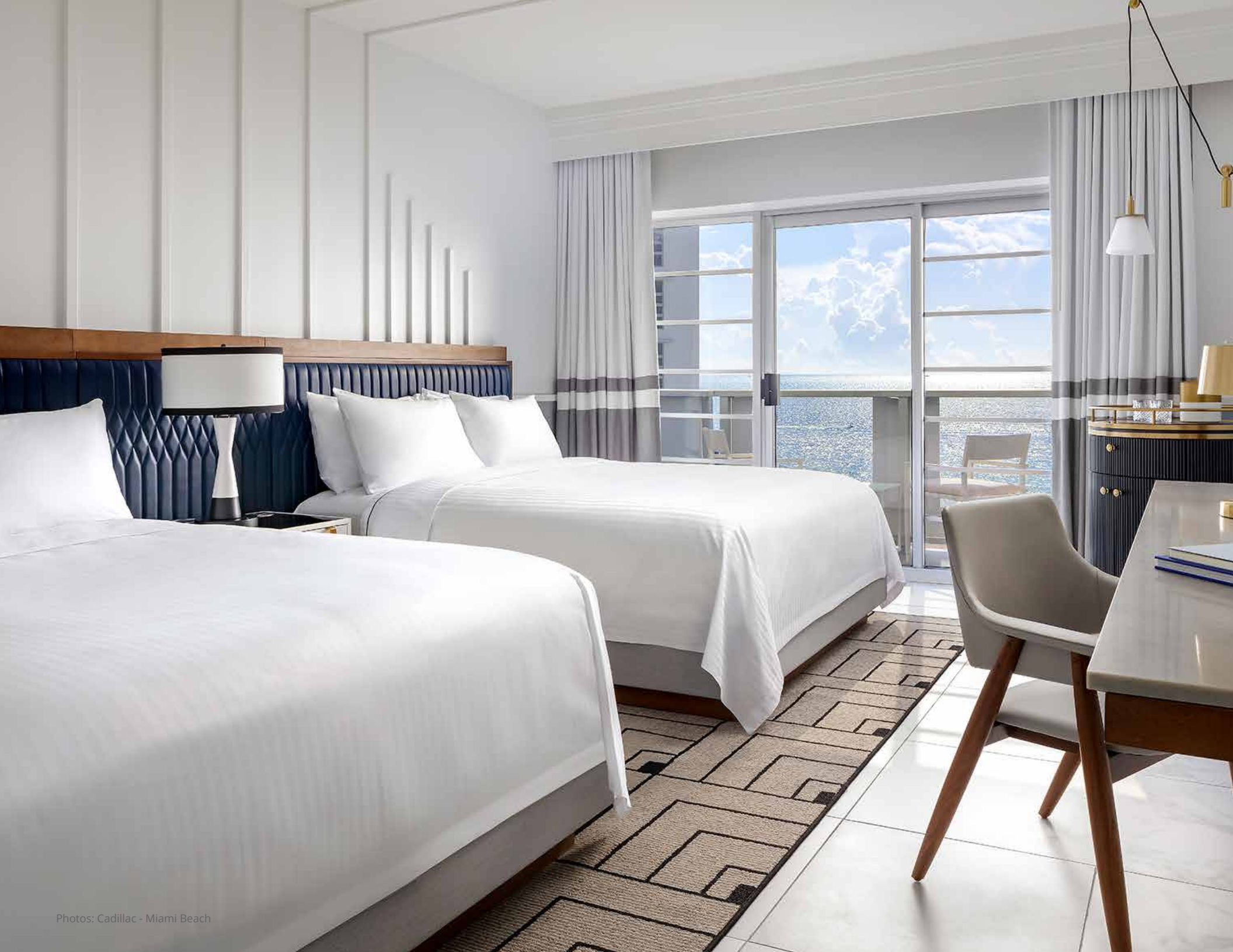
Photos: Cadillac - Miami Beach