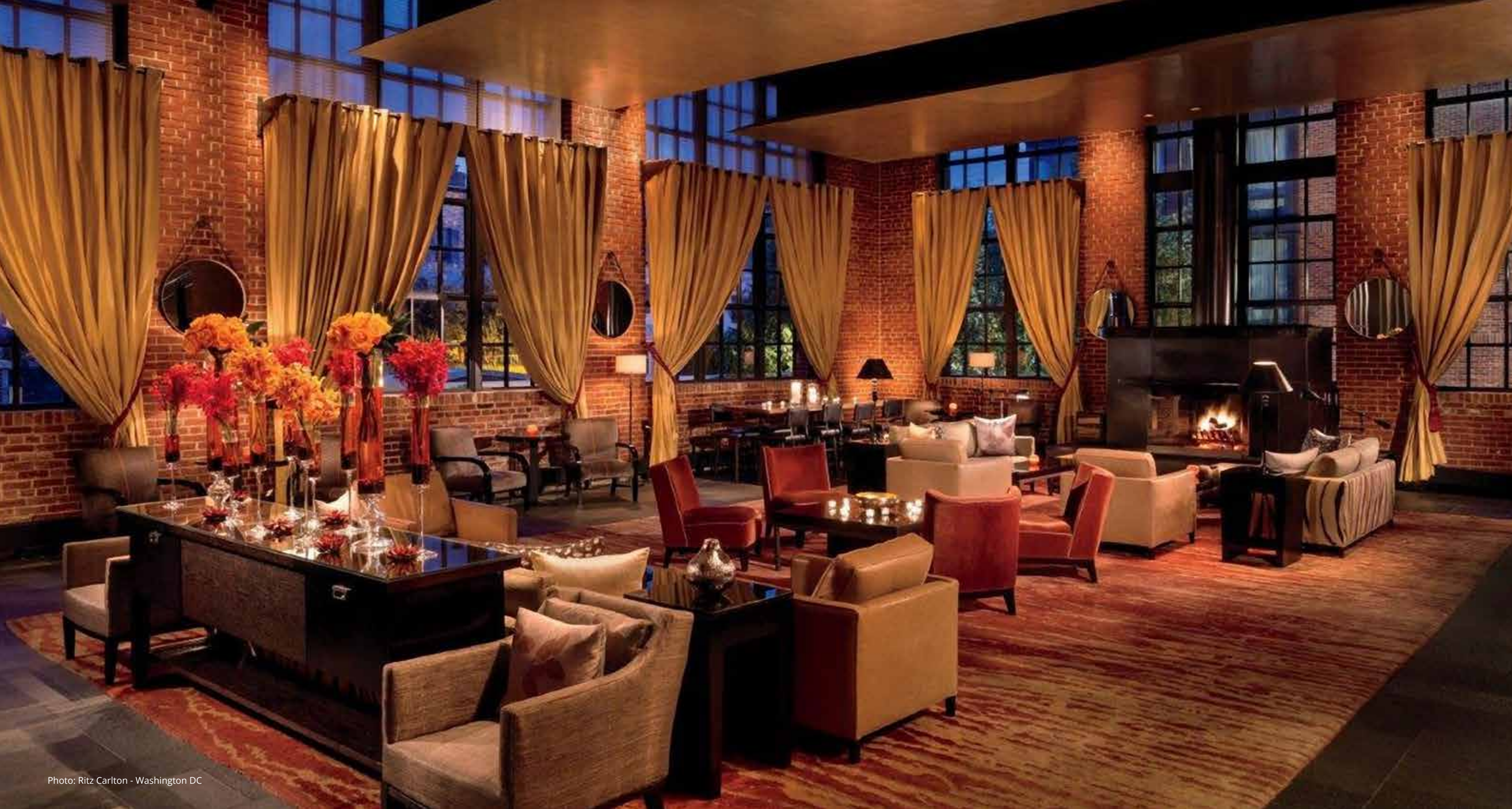
Photo: Ritz Carlton - Washington DC